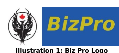
Illustration 1: Biz Pro Logo

SageTea Technology is designed to rapidly generate new products and integrate them with technical services. The commercial small business line for this line of business is called BizPro.